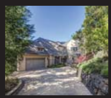
1161 Estates Dr Represented Sellers