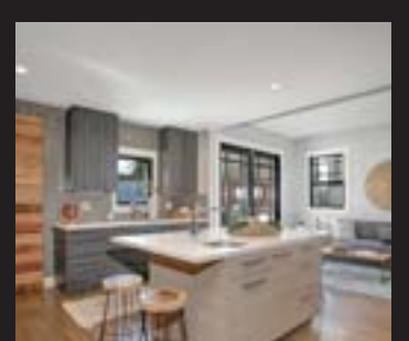
5328 Locksley Ave Represented Sellers