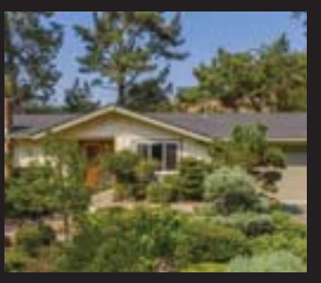
123 Devin Dr Represented Sellers