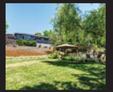
3619 Lincoln Way Represented Sellers