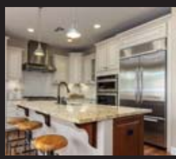
2 Jack Tree Knoll Represented Sellers