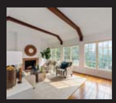
1079 Underhills Rd Represented Buyers