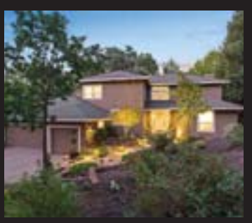
246 Valleton Ln Represented Buyers