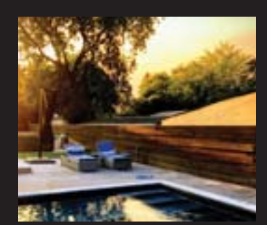
17 Cedarbrook Ct Represented Sellers