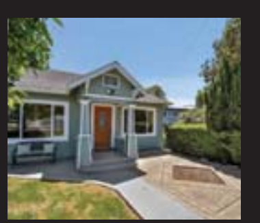
3468 Midvale Ave Represented Buyers